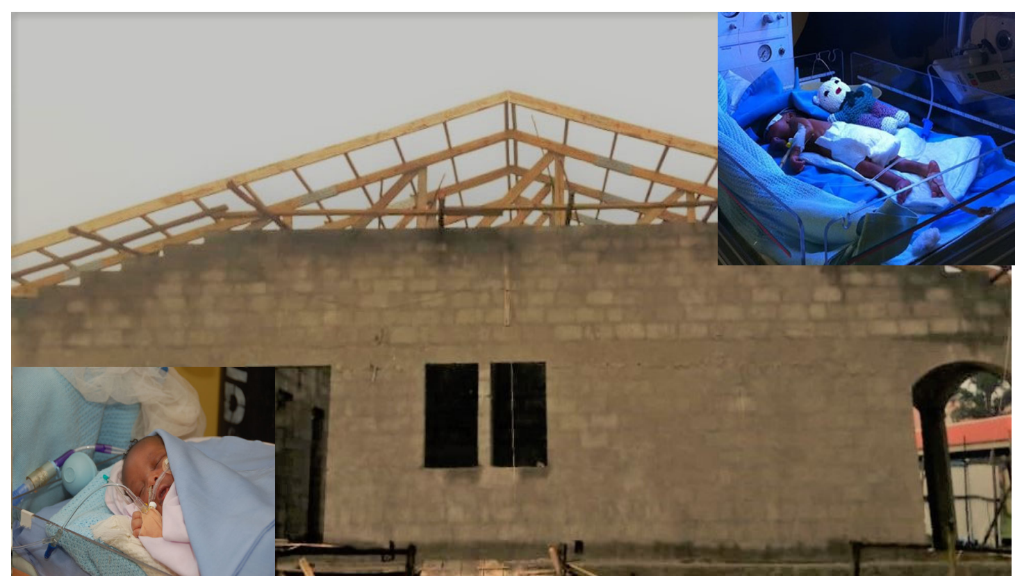
Infant Critical Care Ward Construction Underway!