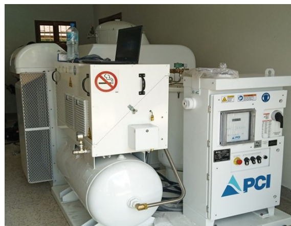
New oxygen generation system now operational!