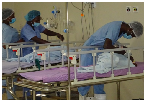
Surgical Center staff in pre-op prepare two children for surgery