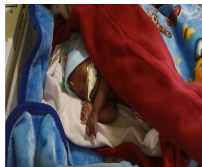
Premature infant receives life-saving treatment