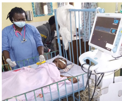
7-year-old girl being treated for viral encephalitis.

2019, we've performed over 2,000 surgeries! We are so proud of the all-Ugandan staff at Holy Innocents who has performed this extraordinary labor of love, and we're grateful beyond measure for your compassion and caring in supporting their efforts! Together we have brought about a world of change for children in Mbarara.