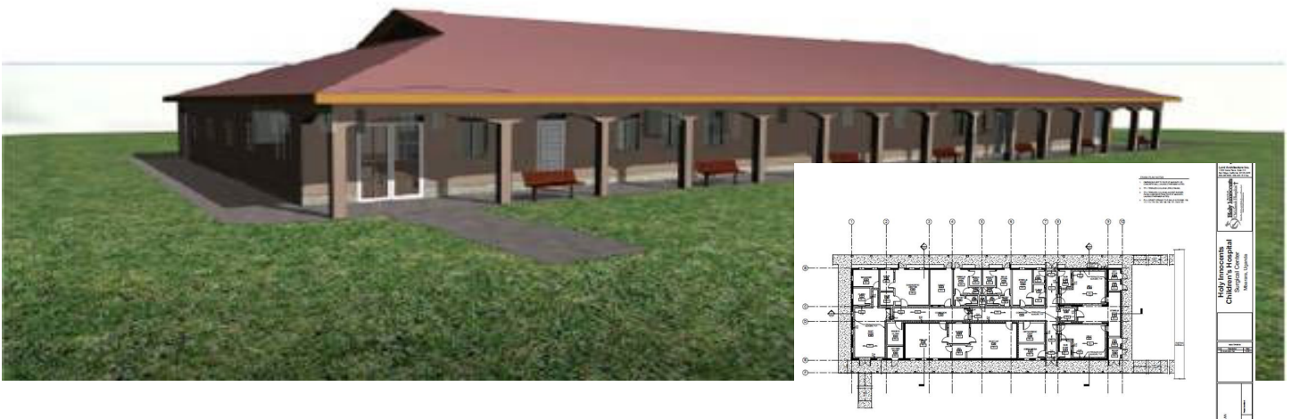
Artist rendering of proposed Surgery Center