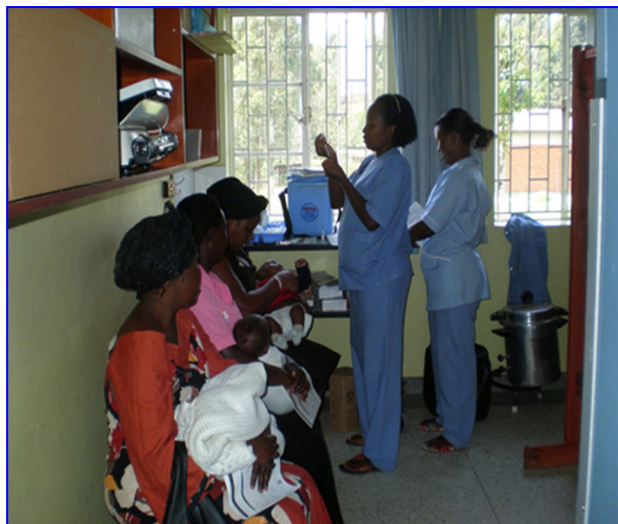
Immunization Clinic is held every Wednesday

We also wish to thank the Knights of Columbus for their help. Our Spaghetti Dinner fundraiser was a huge success this year, and the Knights also helped with annual Mission Pancake Breakfast. So many wonderful friends and organizations lend their support to Holy Innocents.