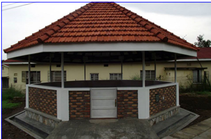
African Hut constructed by our friends from Belfast

Many thanks to our friends in Northern Ireland, who constructed an African Hut used by families of patients as a place of shade and rest outside the clinical areas. The African Hut is also used by staff for monthly community health meetings and to celebrate Mass.